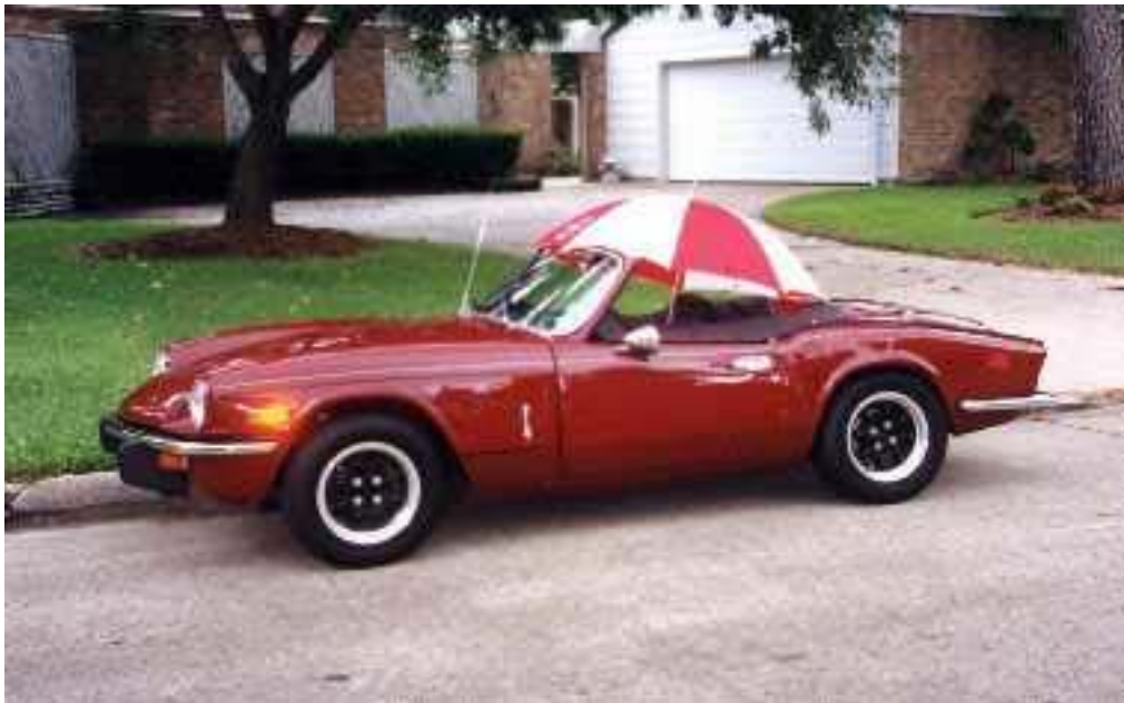
Houston Weather Protection