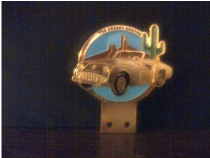
Grille badge (3 inch diameter)

We have grill badges for $25.00 each and lapel pins for $5.00 each available for purchase.