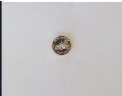
Lapel pin (3/4 inch diameter)

Membership fee _____ Name tags @ $6.00 each _____ Grille badges @ $25.00 each _____ Lapel pins @ $5.00 each _____ Total enclosed _____