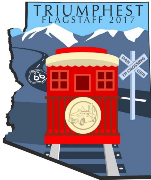
2017 Triumphest Logo