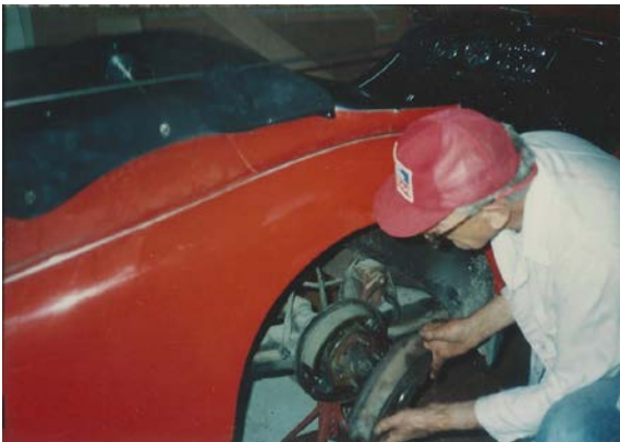
My dad also helped with the restoration on it.

I always regretted selling the TR3 and when my dad found a red one for sale, I couldn't pass it up.