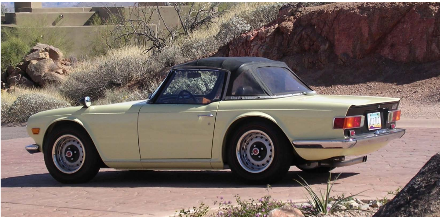
A very pretty Triumph!