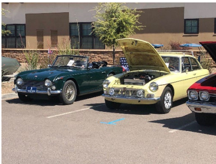
TR250 & MGB-GT