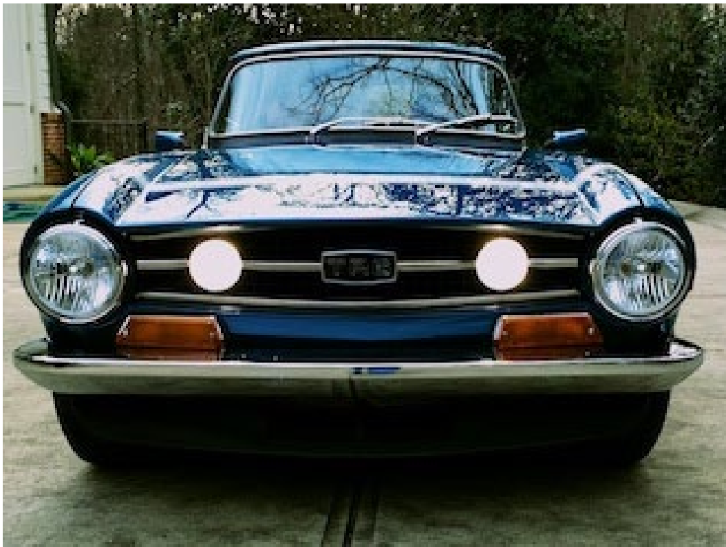
Ashford Little's 1970 TR6