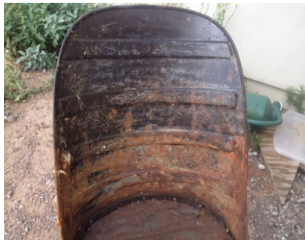
rusty seat back