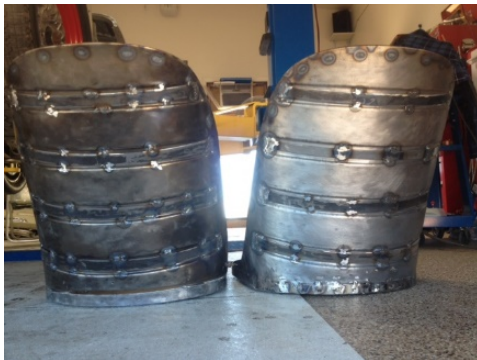
Welded and supported seat backs