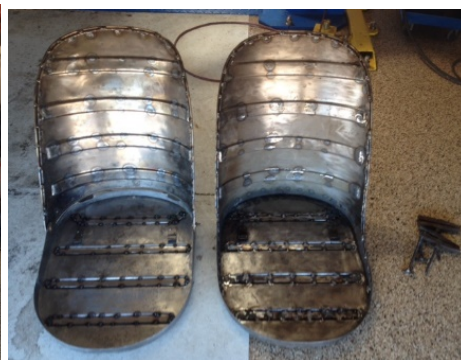
welded and supported seats