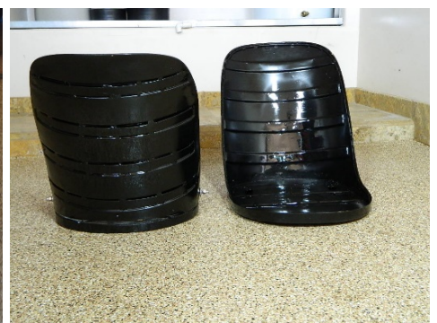
completed and painted