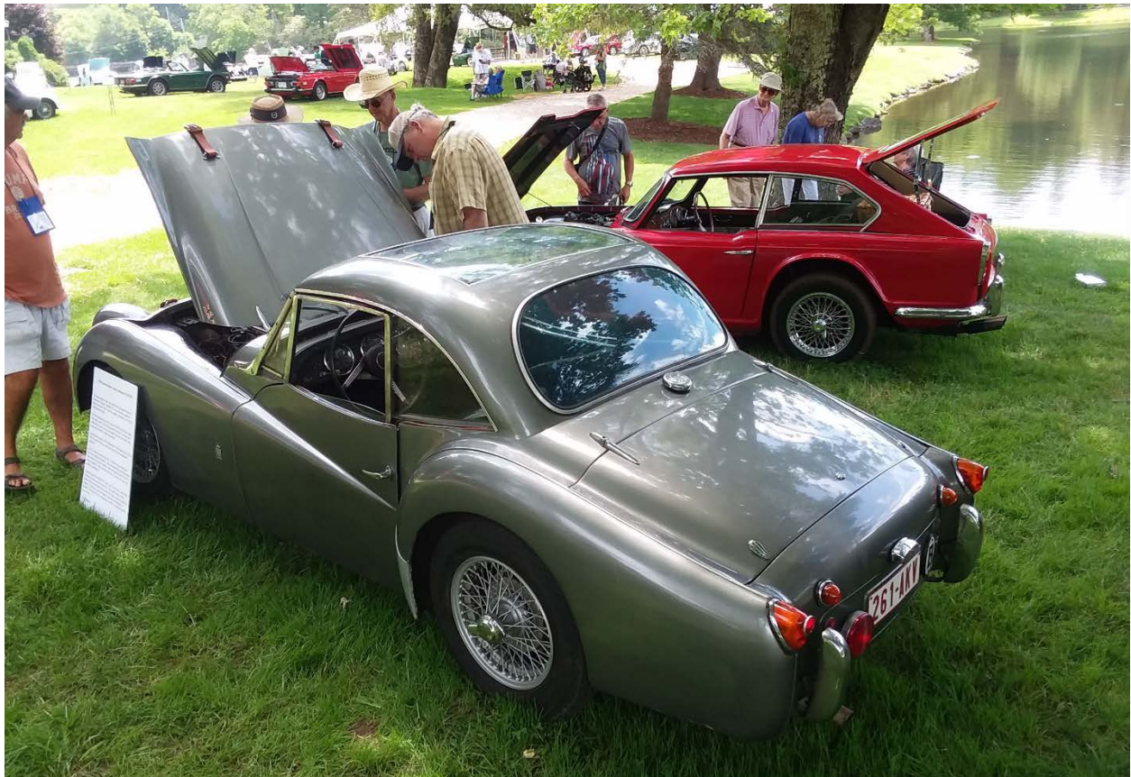
A Francorchamp Triumph

August 2018 Vol 39, Issue 8 http://www.dctra.org