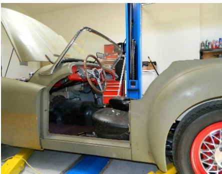
In the beginning

I purchased ¼" diameter rod and 1/8" X 1" flat stock in 4 ft lengths from Home Depot. After I had reformed the seat backs, so they were symmetrical, and straightened the seat bottoms, I bent these and welded them into position, to hold the seat frames in their proper position and to give them additional strength and to ensure they would be rigidly attached to the seat rails. My next step is to decide on whether to have a professional installation of the red leather upholstery (original factory color), or to tackle the job myself.