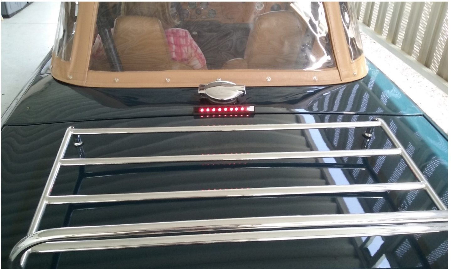
The 3 rd Taillight