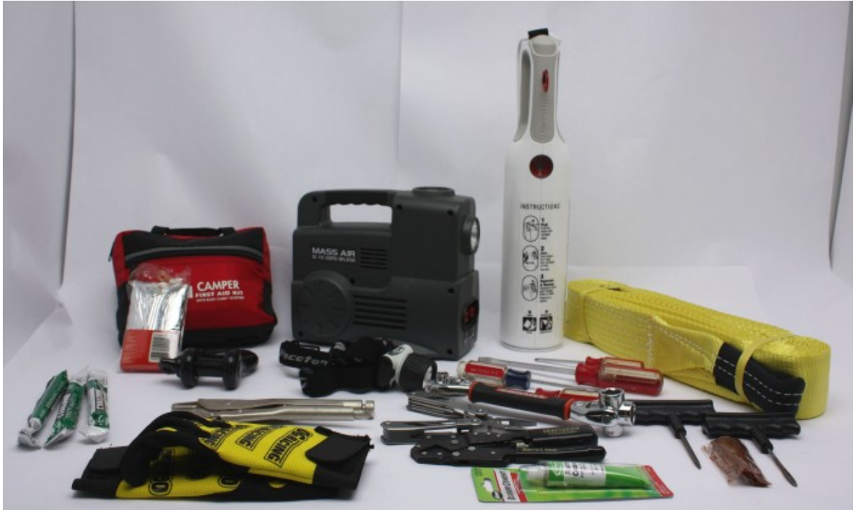
(Most of) the author's breakdown kit.

Spend enough time on the road, and something is bound to go wrong. Murphy's Law tells us that this will happen at the worst possible moment, in the worst possible location, in (likely) the worst possible weather. Few seem to find flat tires in their driveway on a sunny weekend afternoon; instead, flats are generally encountered on a snowy or rainy highway commute to work. Likewise, breakdowns rarely occur next to a service station or automobile dealer; instead, when components fail, they tend to do so far from the potential aid of businesses and passers-by. In the days before cell phones, drivers were much more inclined to travel with a "breakdown kit" containing essential tools and supplies, but many have tucked such kits into the corner of a garage, believing that help is now just a phone call away.