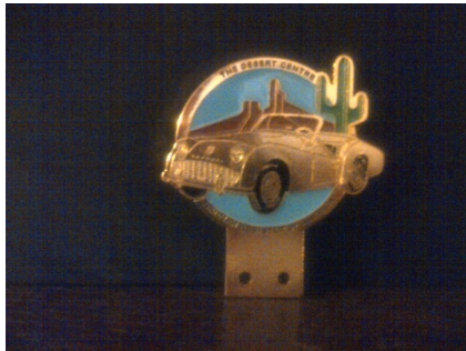
Grille badge (3 inch diameter)

We also have Grill badges ($25.00 each), Lapel pins ($5.00 each) and License plate frames (15.00 each) available for purchase.