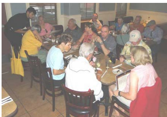
There were AZ Mini diners, MG diners and three Triumph diners present.