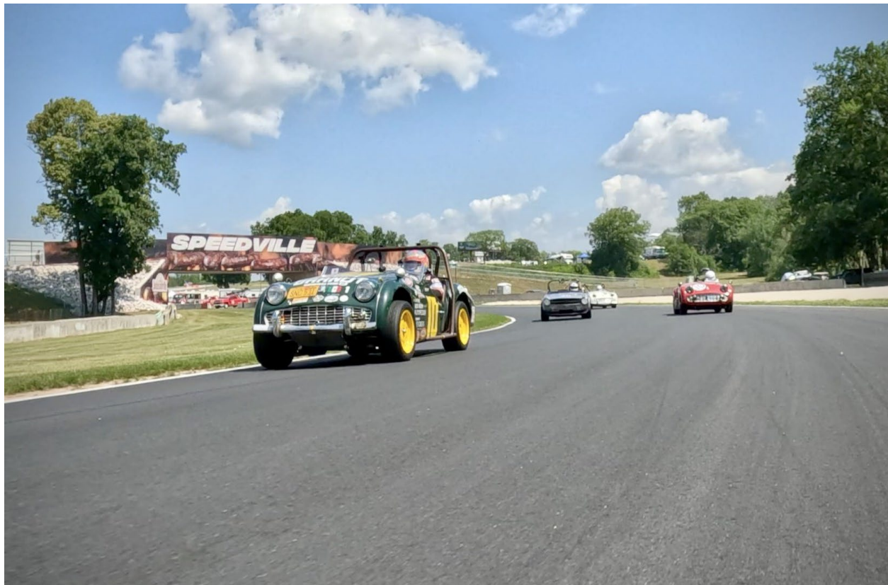
Running for the Kastner Cup