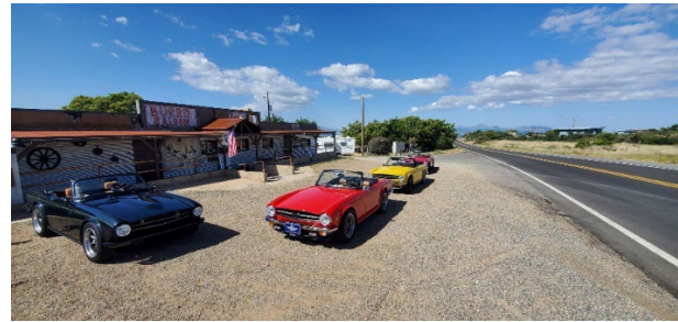
The cars meet for a TR playdate

It's an interesting moment to consider these cars are all over 45 years old, and I cannot imagine the original Triumph Factory designers in Coventry, England thinking these cars would be zooming across Central Arizona 45 years later. In fact, I can report we only had a minor electrical rear indicator lamp fault. The Prince of Darkness is an international demon, who teleports across the World. Other than that, all the cars drove well and no major issues.