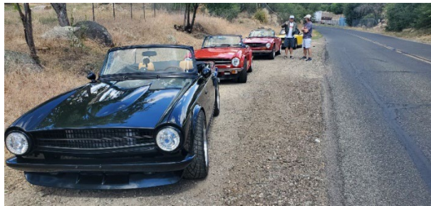
Another moment for a selfie

It's an interesting moment to consider these cars are all over 45 years old, and I cannot imagine the original Triumph Factory designers in Coventry, England thinking these cars would be zooming across Central Arizona 45 years later. In fact, I can report we only had a minor electrical rear indicator lamp fault. The Prince of Darkness is an international demon, who teleports across the World. Other than that, all the cars drove well and no major issues.