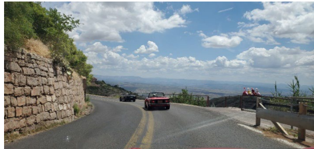
What a view from Jerome

As owners I'm sure you also enjoy the fun part of driving these cars around towns and cities. The number of people waving or asking what year it is, taking photos is so satisfying. Then a quick 30 second chat about a family member who owned one, before the light changes. It clearly gives people joy to see a car they so fondly remember, or have never seen before.