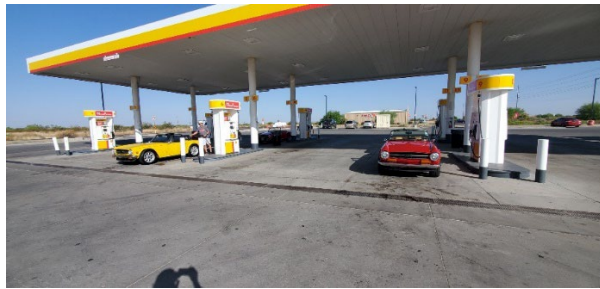
Gassing up at a Shell Station