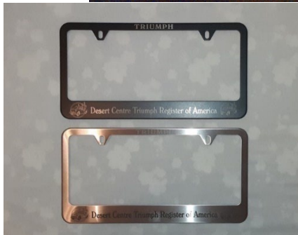
Grille badge (3 inch diameter) frame