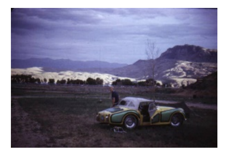
Camping near Yellowstone

We had a great time in Yellowstone. Many people talked to us about the car and took pictures of us next to it. We even got pulled over by a Police officer outside of Yellowstone Park. We were very concerned, when the lights came on. After we pulled over to the side of the road, I asked him what we were doing wrong. He said: "I thought I saw something white on your windshield, which could have blocked your view and could cause an accident!" We assured him, we did not have anything white on our dash or in the front seat area. He then gave us a big smile and said; "There wasn't anything there, I just wanted to see your car and talk to you". This TR3 was more popular than we could ever be. We talked for a few minutes and he wished us a safe trip.