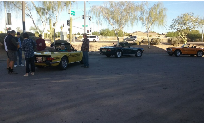
Hey, it's almost 9am. Can we go now?