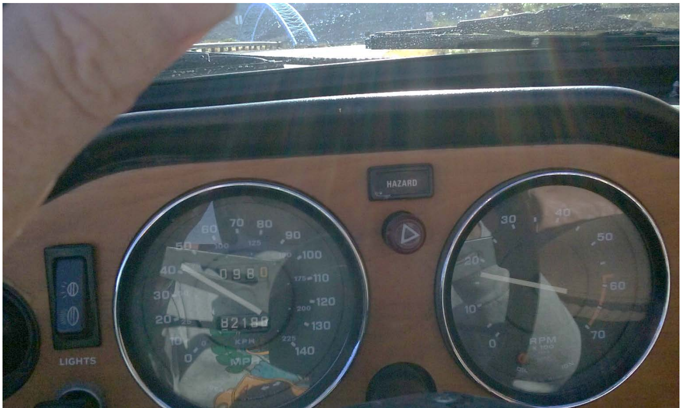
Dashboard of a TR6