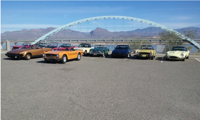
Group photo at the dam showing the bridge.