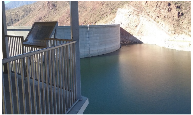
So, here is the dam.