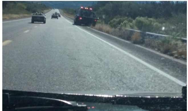
This truck pulled over for us to let us go by.