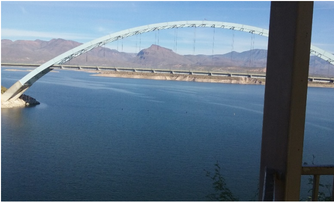
This is a beautiful bridge over the lake or is it the Salt River?.