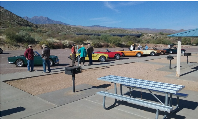
Rest stop to discuss the drive.