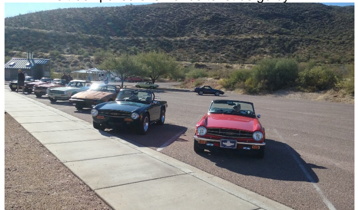
Ok, rest over! Time to head out again.