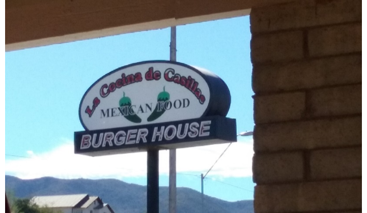
Our dining experience. Wonderful.