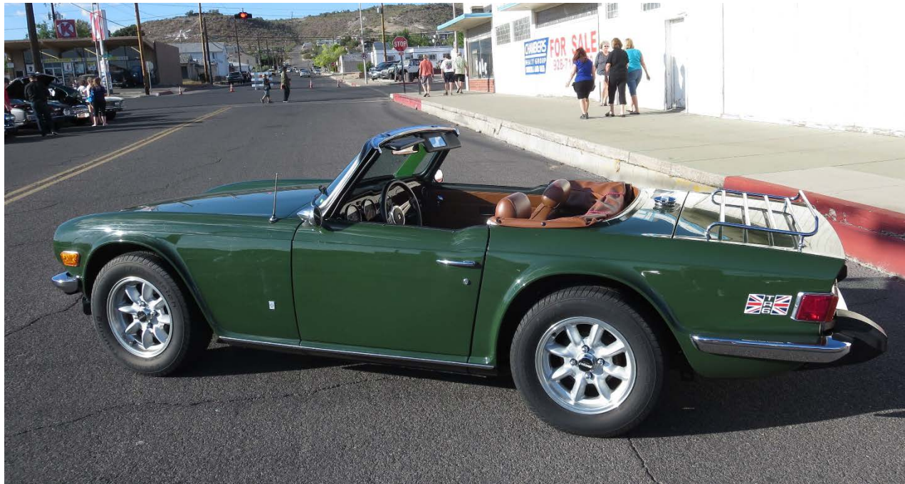
One of my favorite TR6s