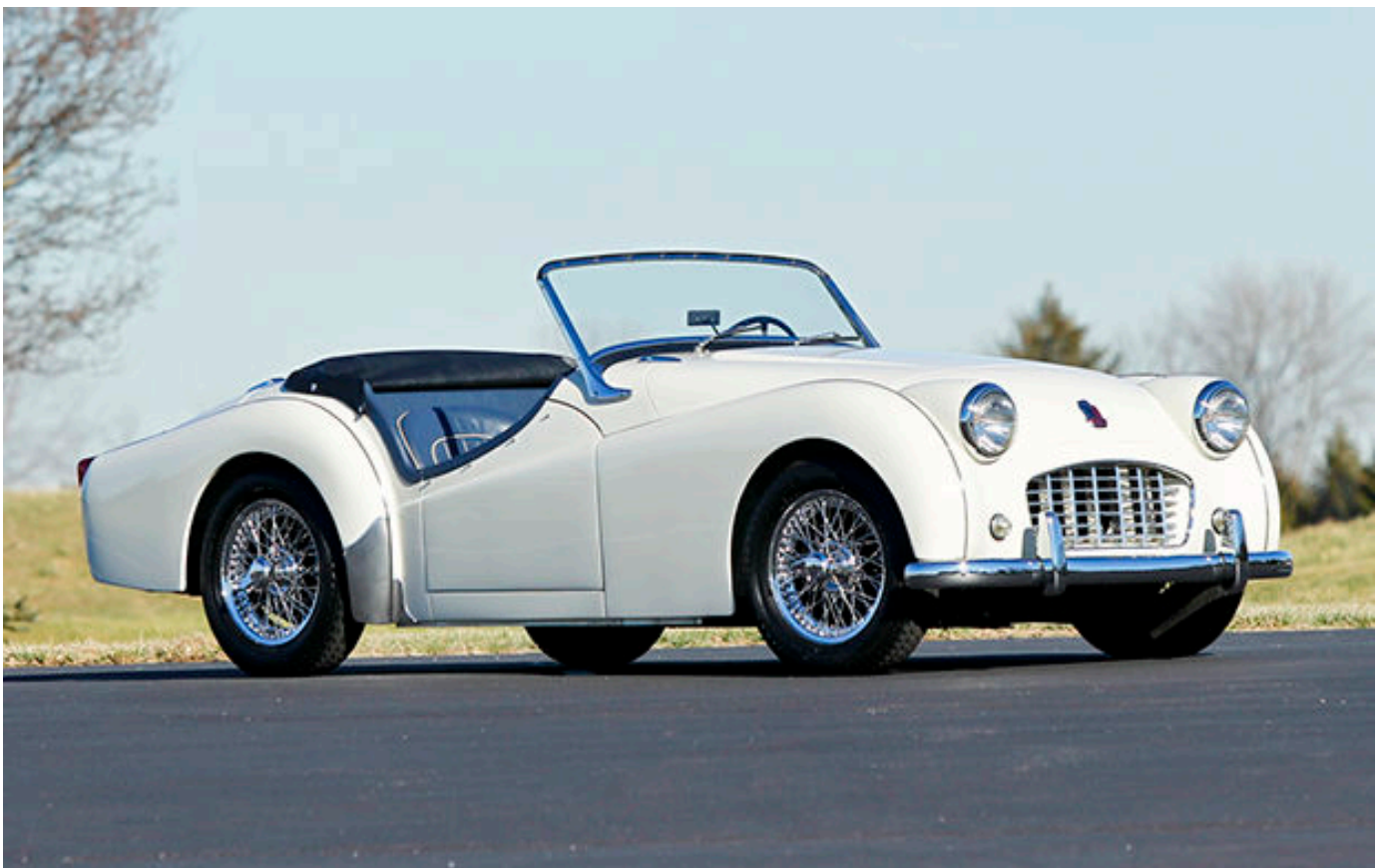
A beautiful 1957 TR3