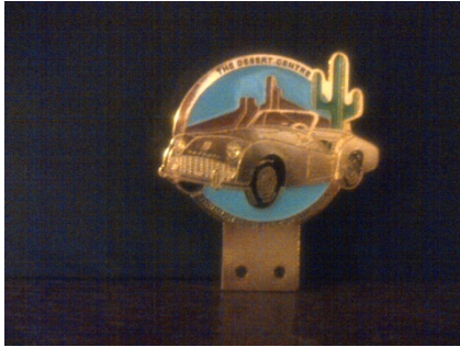
Grille badge (3 inch diameter)

We also have Grill badges ($25.00 each), Lapel pins ($5.00 each) and License plate frames (15.00 each) available for purchase.