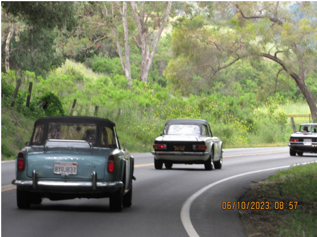
What a beautiful drive