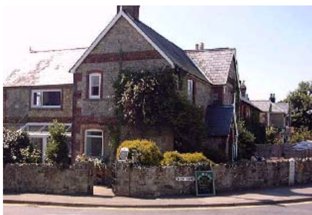
Brighstone - Tea Garden