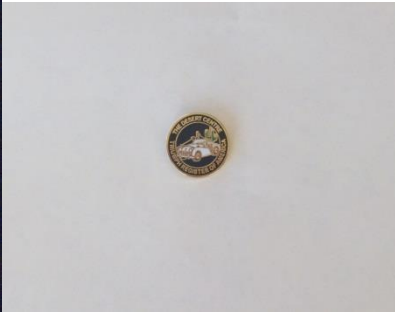
Lapel pin (3/4 inch diameter)

Membership fee _____ Name tags @ $6.00 each _____ Grille badges @ $25.00 each _____ Lapel pins @ $5.00 each _____ Total enclosed _____