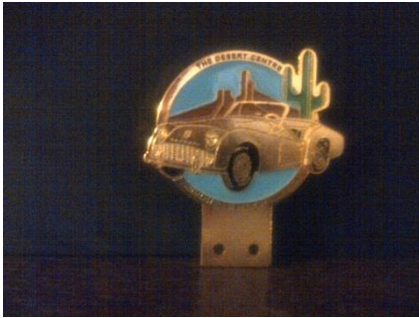
Grille badge (3 inch diameter)

We have grill badges for $25.00 each and lapel pins for $5.00 each available for purchase.