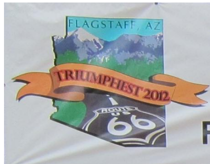
2012 DCTRA Triumphest Logo