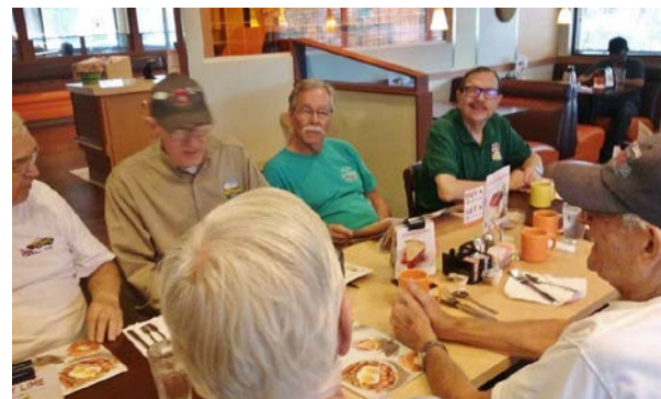
The eagles gather for the after event breakfast at a Village Inn for further discussions