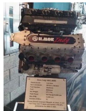
One of the exotic race engines