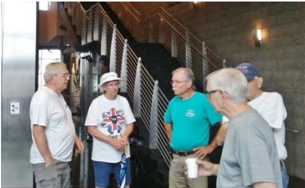
Members discussing their racing war stories

The museum people put out coffee and drinks for all and we enjoyed them, after some time the group decided to visit the Village inn just south of Penske's for a good breakfast. I think everyone had a good morning. During the hot weather we should be encouraged to go places driving our air cooled cars, So I will set up a couple of runs.