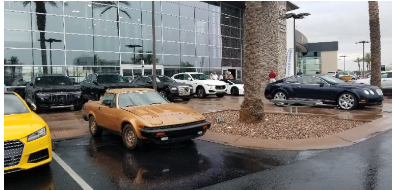
Horton's TR8 at the museum

The museum people put out coffee and drinks for all and we enjoyed them, after some time the group decided to visit the Village inn just south of Penske's for a good breakfast. I think everyone had a good morning. During the hot weather we should be encouraged to go places driving our air cooled cars, So I will set up a couple of runs.