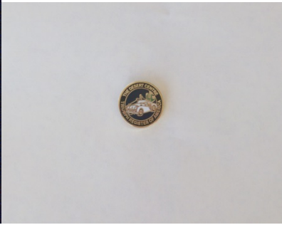
Lapel pin (3/4 inch diameter)

Membership fee _____ Name tags @ $6.00 each _____ Grille badges @ $25.00 each _____ Lapel pins @ $5.00 each _____ Total enclosed _____