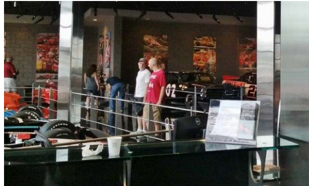
More war stories