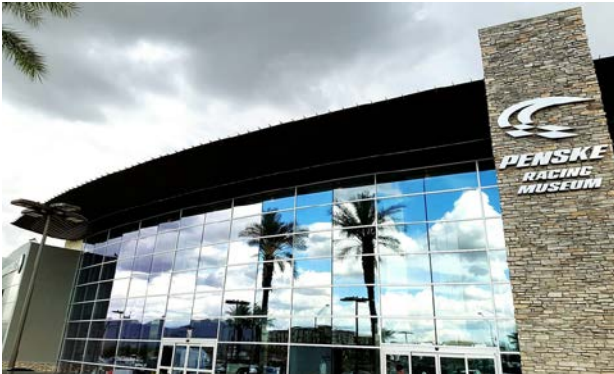
The Penske Racing Museum

On June 14 th stalwart Triumph owners visited the Penske museum. The day started out cloudy but as I drove along the 101 to Scottsdale (with the top down) I noticed a couple of drops on the windscreen. By the time I got to the museum, it was beginning to rain. I had help putting the top up and we went in. I was really amazed by the race cars. After seeing them on the tube and now actually seeing these monsters in them flesh... they are BIG. Easily as big as my Toyota sedan.