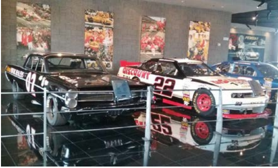
A different racing category