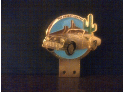
Grille badge (3 inch diameter)

We also have Grill badges ($25.00 each), Lapel pins ($5.00 each) and License plate frames (15.00 each) available for purchase.