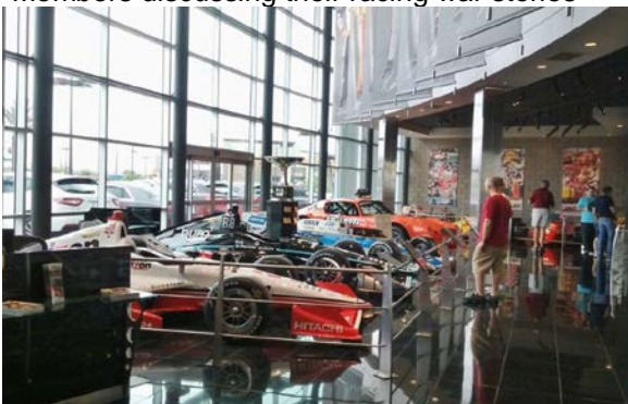
Display of cars