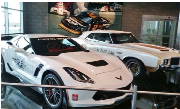
Two Indy Pace Cars