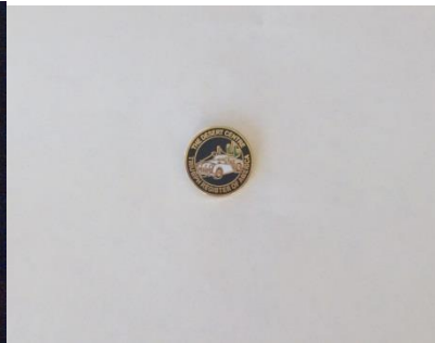
Lapel pin (3/4 inch diameter)

Membership fee _____ Name tags @ $6.00 each _____ Grille badges @ $25.00 each _____ Lapel pins @ $5.00 each _____ Total enclosed _____