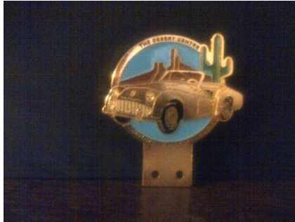
Grille badge (3 inch diameter)

We also have Grill badges ($25.00 each), Lapel pins ($5.00 each) and License plate frames (15.00 each) available for purchase.