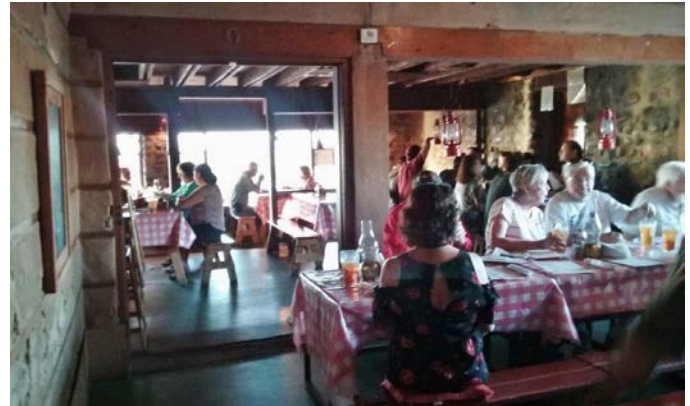
More diners and interior of restaurant