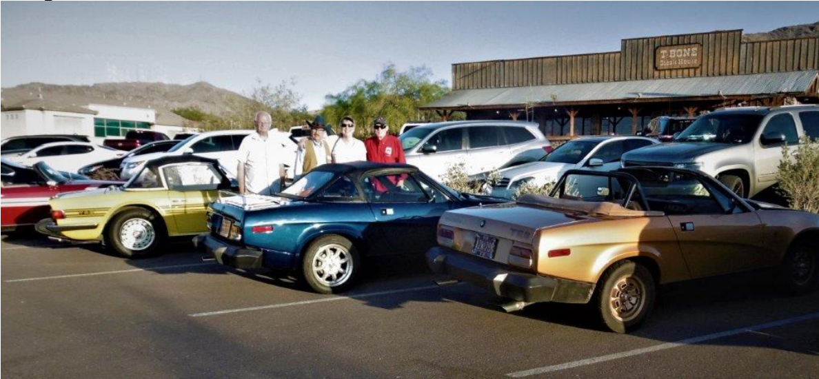
DCTRA members before entering the T-Bone Steak House

Four stalwart people drove their sorts cars. The food was good. Everyone seemed to have a good time. The service was quick. Kind of funny, they put bread, bowls of beans on tables, and the steaks come on a plain plate. You load it with your choices. I think there are a couple of different events we can go to in in near future.