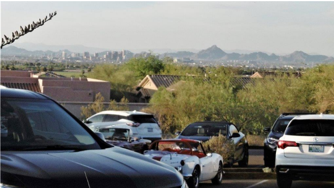
DCTRA at T-Bone Steak House, view of the PHX Valley from the porch.