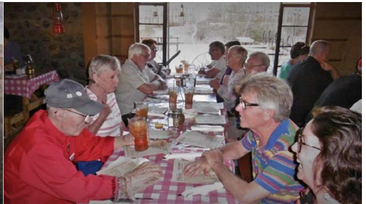
Diners while still light outside.