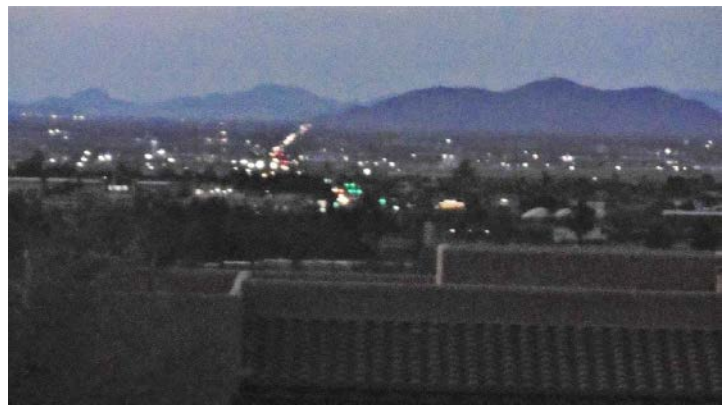
Another view of the PHX Valley at twilight with city lights showing