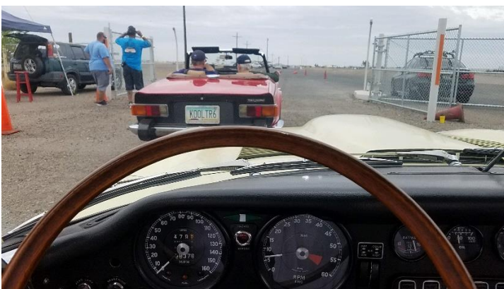
The queueing view from Mike Goodwin's car.