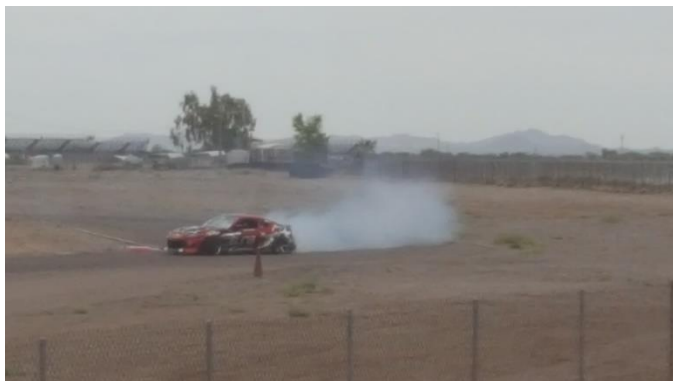
One of the