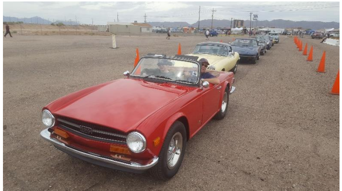
All queued at the start lined ready for our parade laps.