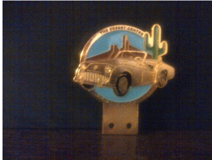
Grille badge (3 inch diameter)

We also have Grill badges ($25.00 each), Lapel pins ($5.00 each) and License plate frames (15.00 each) available for purchase.