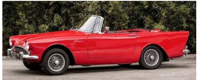
A similar Sunbeam Alpine

Anyway, my poor substitute was the 1960 Alpine which was already owned and just needed another 100 hours of me crawling around with various tools and a bunch of machine shop work on the engine.... all for less than a thousand dollars in those days. The rebuild, repaint, new interior work went very well and the Alpine was beautiful and served me well for another 3 years before the master clutch cylinder went out just as I was leaving for college.