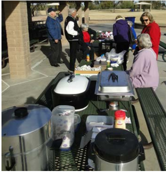
Waiting for everyone to arrive

On the 10 th of February, the Arizona Mini Club held their annual Pancakes in the Park, a breakfast rally that starts at 32 nd Street & Shea, Phoenix and ends at varying parks here in the valley. This year it coincided with the annual Drive Your Triumph Day. Our Triumph members were encouraged to use that event to drive their TRs to the Pancakes In The Park.