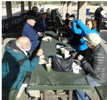
Enjoying pancakes & fixings