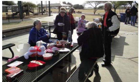
Selling of the raffle tickets