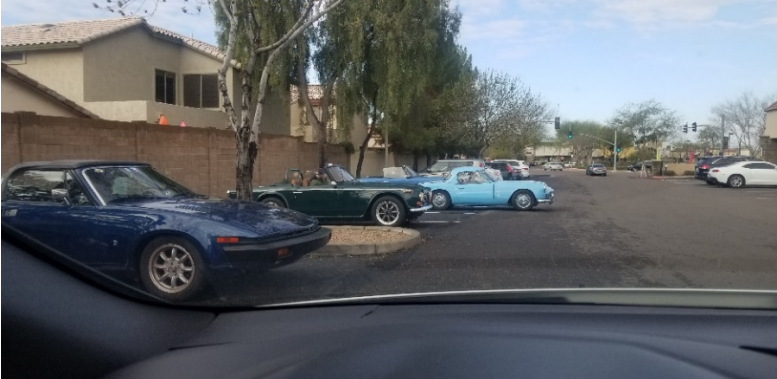
Assembling at a Starbucks on Ellsworth and Superstition Hwy