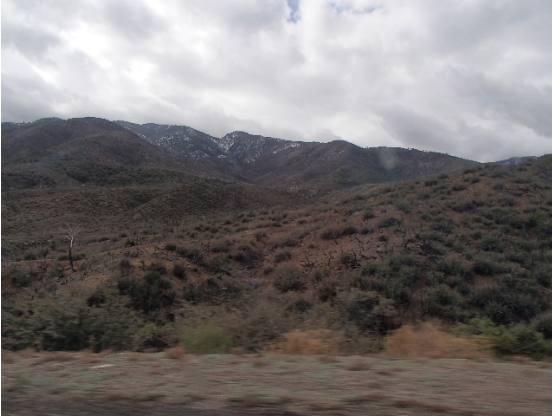
Mountains near Globe

To avoid the Renaissance Faire traffic the Triumph drivers followed a zig-zag route south and east to north SR 79 and then on to east US60. The road to Superior is interesting though most have driven it so much there is nothing new to see. But how many have seen the natural bridge before the Queen Creek tunnel or the Elvis rock east of the tunnel? Thankfully there was no construction in the Pinto Creek area to keep us from our goal.