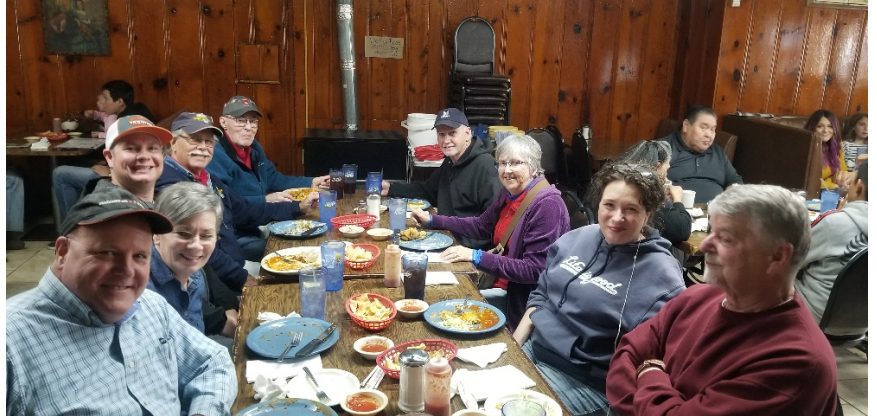
Dinner for nine

Turning right or sort of south just before Judy's Cook House Restaurant, we had a scenic drive over the hills south of Globe. Russell Road is one of those roads that without turning a corner or changing pavement is three roads - Russell road going south from Globe, F.S. 55, then Kellner Canyon Road. Whatever the road is called, it offered changes in elevation, sweepers and tighter corners – a good Triumph road. The folks in the TR6s enjoyed being close to nature - snow on the mountains near Globe, dropping temperature as we drove over the mountains then down into Globe. We regrouped at the Pickle Barrel, a general store / souvenir place. There we made plans to find lunch, since the place next to the Pickle Barrel would not meet our needs. Unfortunately the highly recommended Chalo's was closed. Dave called an associate and they recommended La Casita Cafe, the one open restaurant in the downtown area. It turned out to be very good.