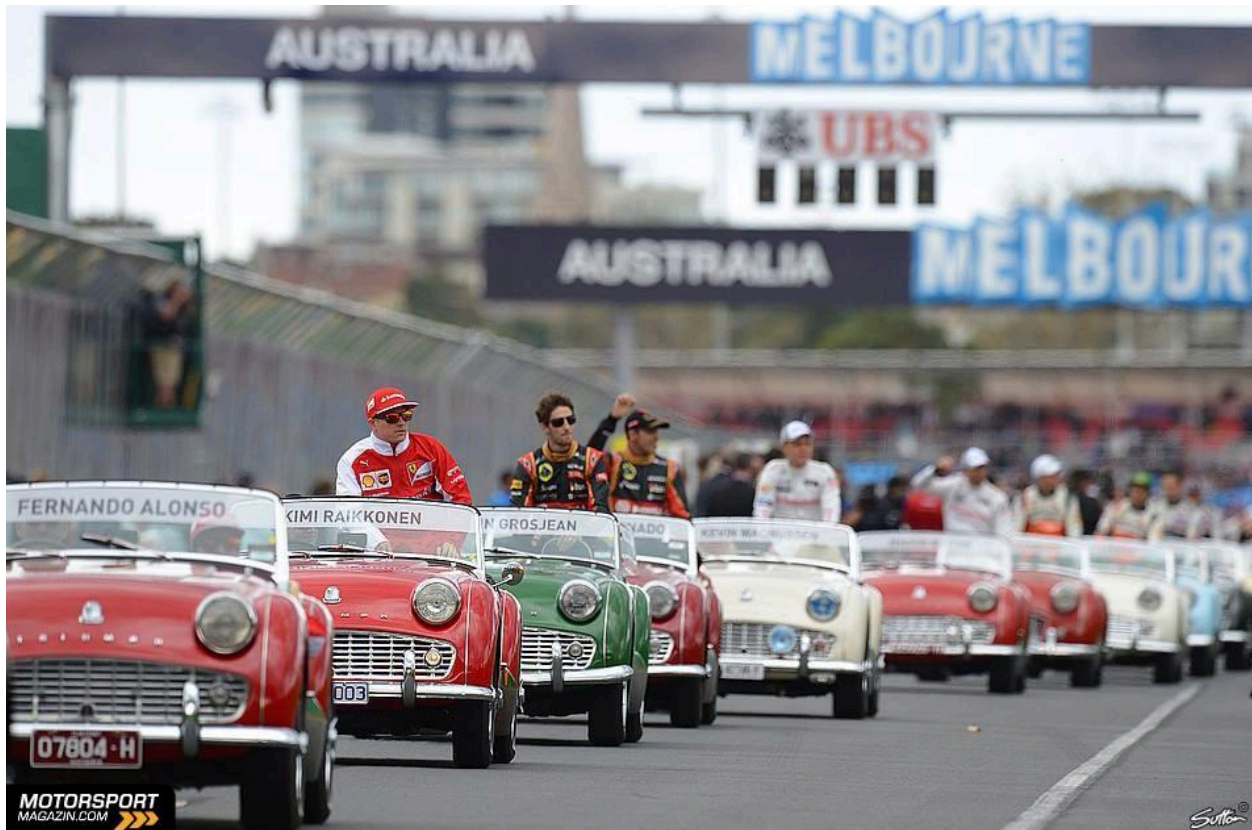
Parade of TR3s at a Melbourne F1 race.