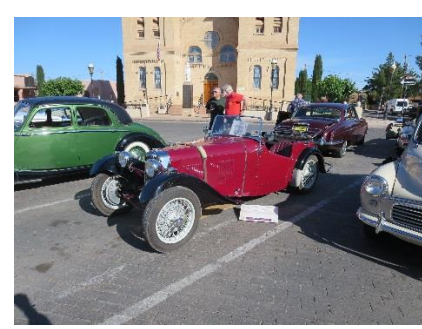
A very rare 1949 HRG