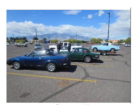
A pit stop in Globe, AZ

A gimmick rallye through wine country was held Saturday afternoon, followed with a banquet held at a beautiful NM State University Golf Course Clubhouse. The Awards Ceremony and Silent Auction results was held Sunday morning at a gorgeous Mexican restaurant, La Posta, serving a delicious breakfast buffet. The photos below are a few of the activities, some of the unique cars, and some of the award winners.