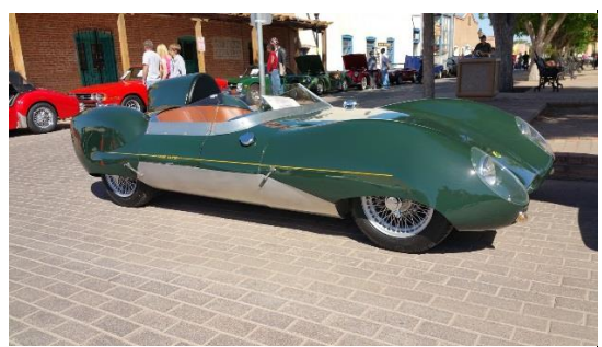
A Lotus Super Eleven