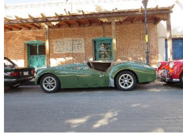
Stu Laswell's Best of C Class