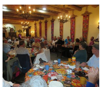
The Awards Breakfast