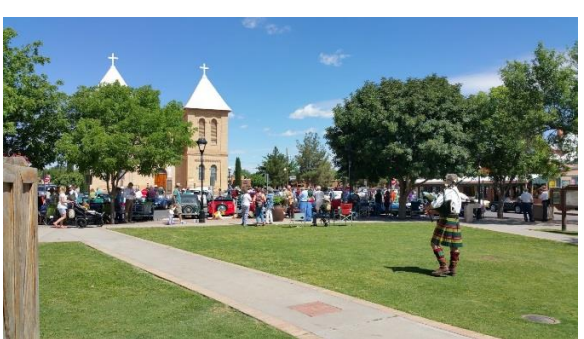
A piper on the Plaza Square