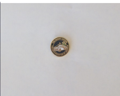
Lapel pin (3/4 inch diameter)

Membership fee _____ Name tags @ $6.00 each _____ Grille badges @ $25.00 each _____ Lapel pins @ $5.00 each _____ Total enclosed _____