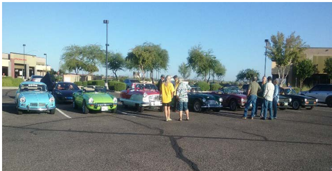
Assembly at the starting point