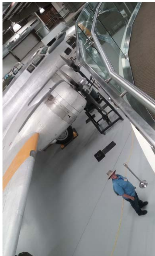
Betsy observing the B-17

Because of camera battery malfunction (dead) I was unable to get any photos of the event at the wine tasting at the Wilhelm Family Winery. The vintner's presentation was one of the best I have witnessed. She gave an interesting tour of the vineyards and an informative explanation of the vinification process, types of wine and how various factors control the results of the wine.