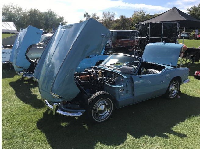
Another blue Spitfire