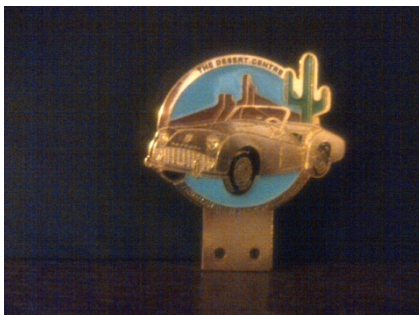
Grille badge (3 inch diameter)

We also have Grill badges ($25.00 each), Lapel pins ($5.00 each) and License plate frames (15.00 each) available for purchase.