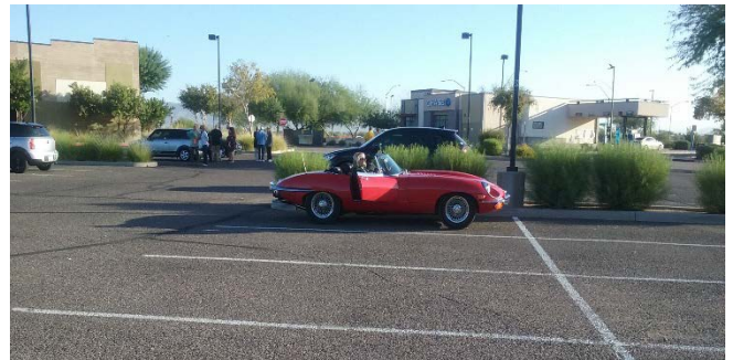
It is a British car event.