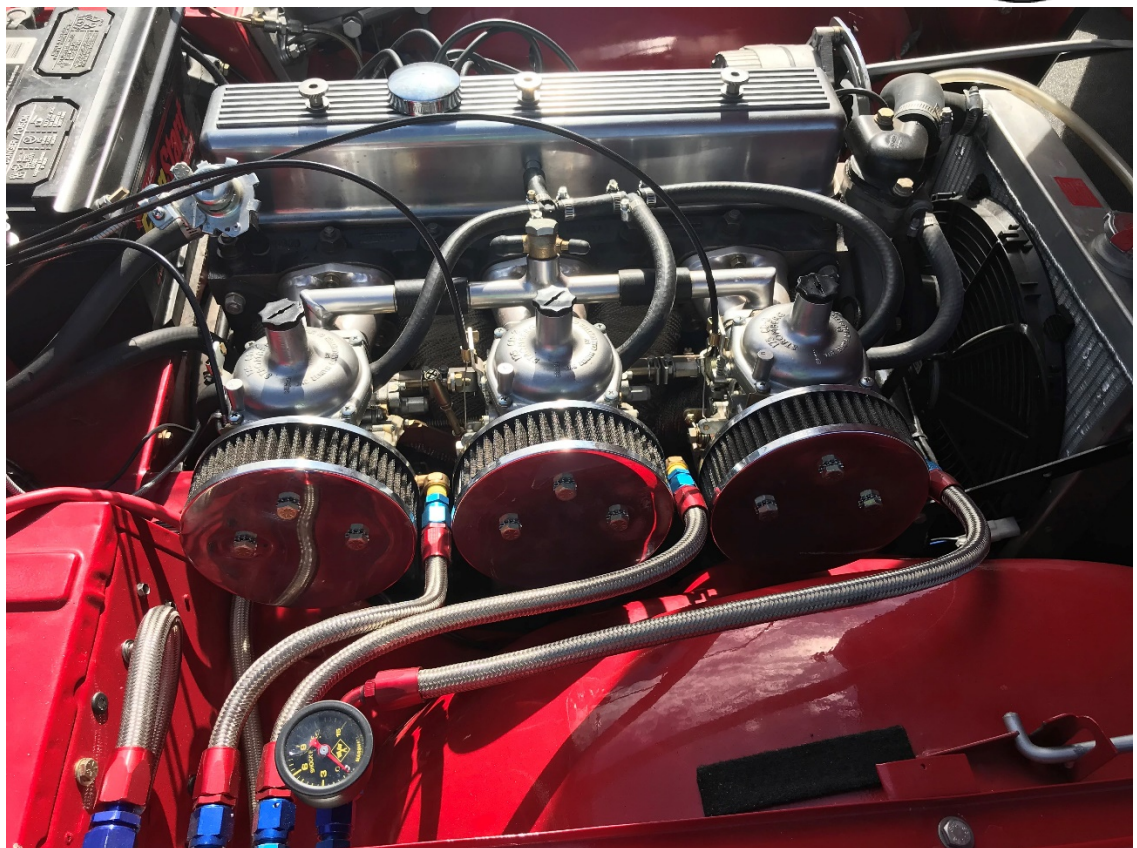
Red TR6 with triple Zenith Strombergs