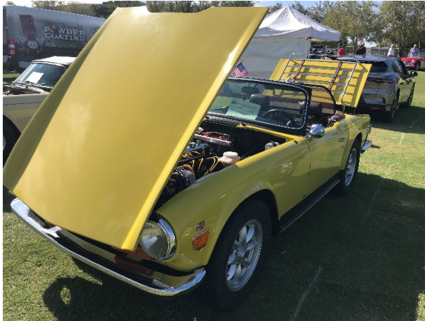
Another yellow TR6