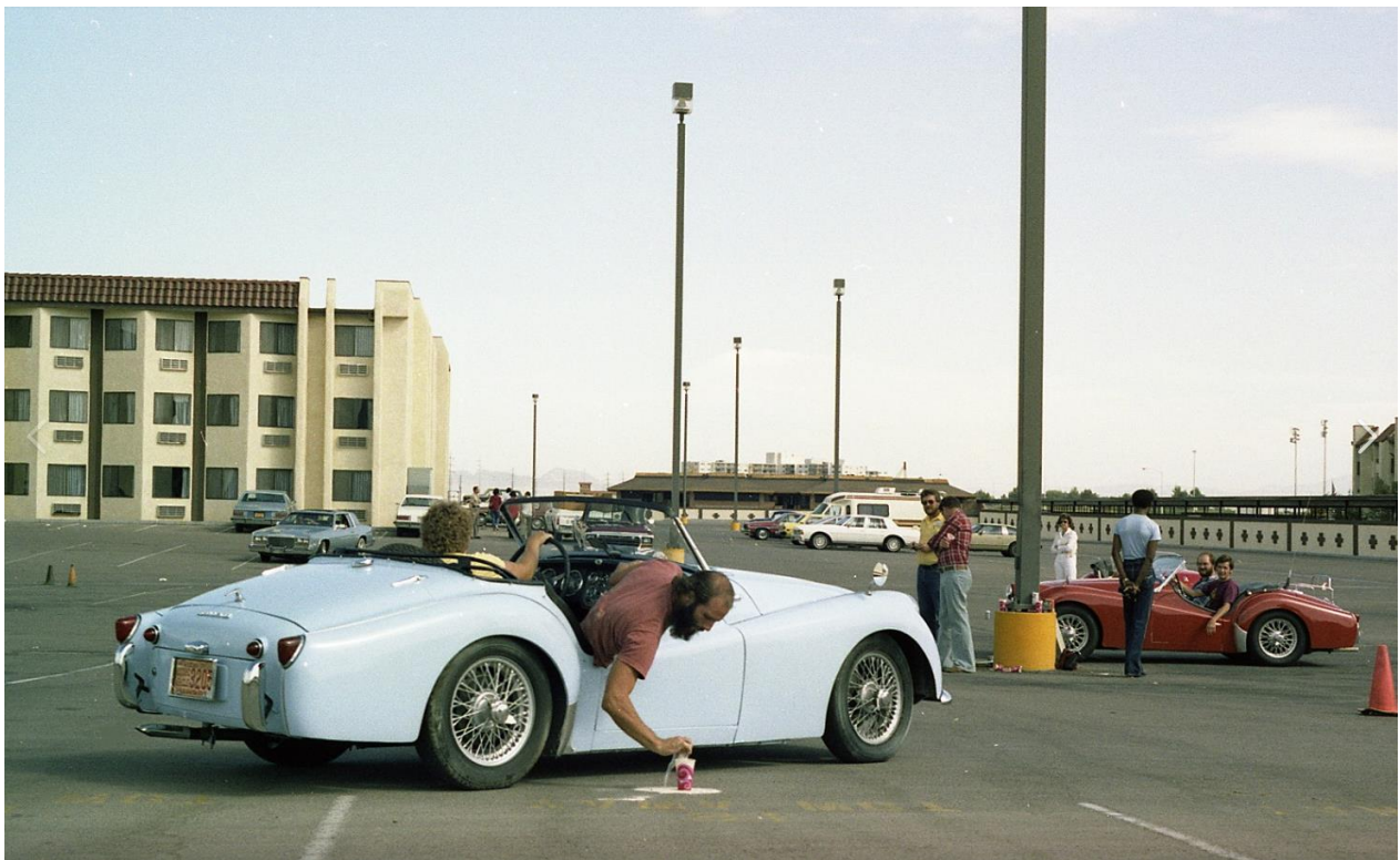
TR West 1982