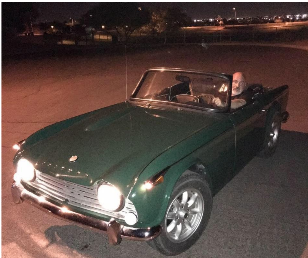
TR4A on a beautiful fall night