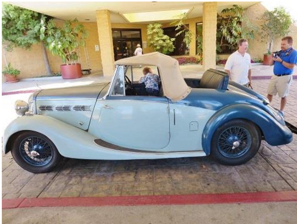
1938 Triumph Dolomite

WITH OUR SISTER CLUB THE ISLE OF WIGHT TRIUMPH CLUB, U.K.