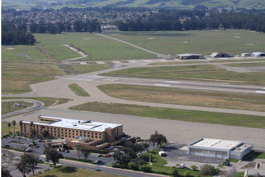
Radisson Hotel located at the Santa Maria Airport

22 members of DCTRA were part of the festivities from September 25 th thru September 28 th . Most DCTRA members brought their Triumphs and competed in the Autocross, the Funcours , the Funkhana, the Tech Session, Hospitality Party and the Awards Banquet. It was a pleasure to see all the cars that made the trip and it was a pleasure to meet and greet old friends from all around the west coast and Canada.