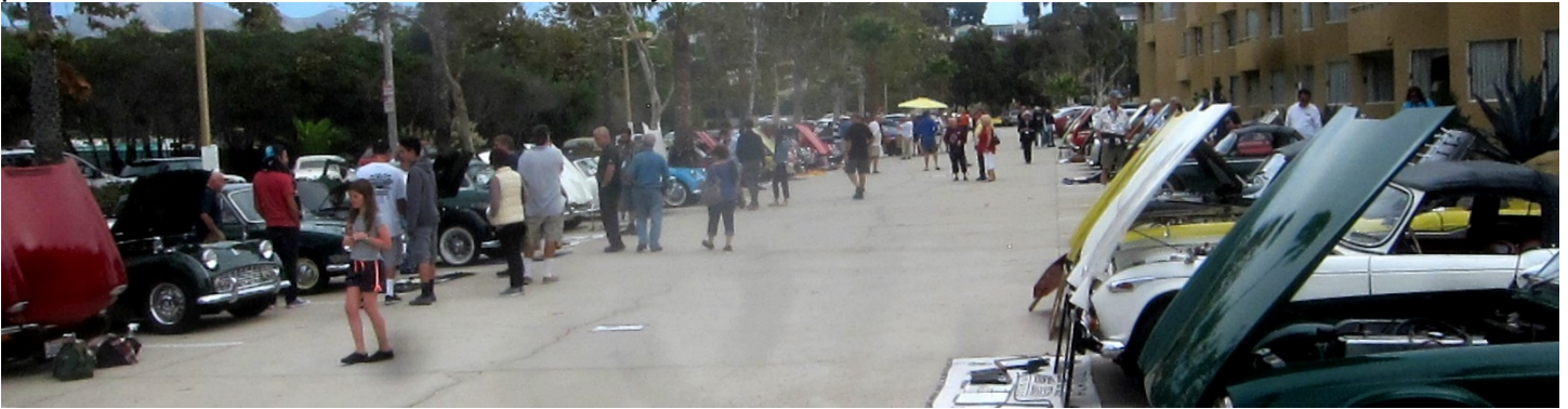
125 Triumphs on display for the Funcours car judging

Saturday morning Triumphest attendees were out in the parking lot getting their cars ready for the Funcours and Concours car judging. I had to take my top off for the autocross and now I had to put it back on for the Funcours, not an easy task on a TR3.