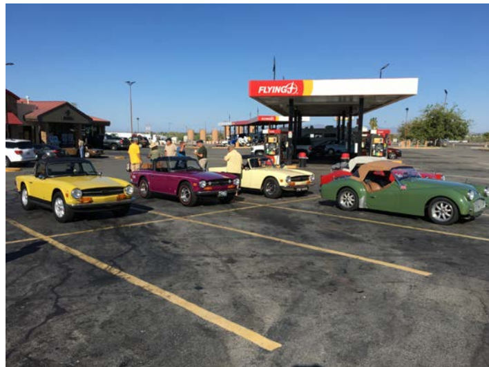
A second gas stop