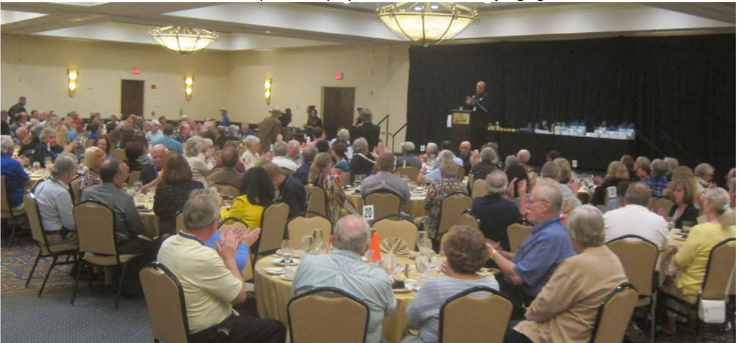
Saturday was time for the Banquet dinner and awards, 180 people attended.