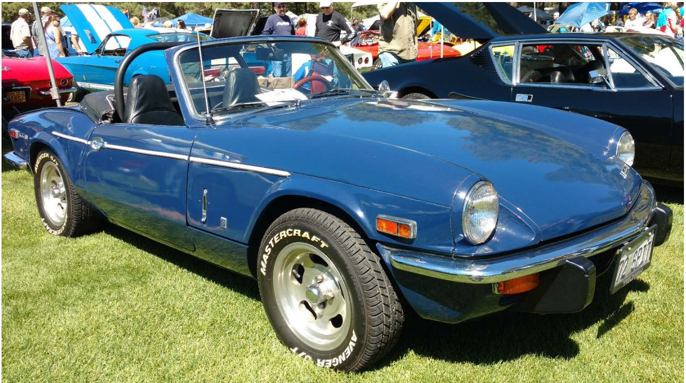
Mk IV Spitfire

October 2016 Vol 37, Issue 10 http://www.dctra.org