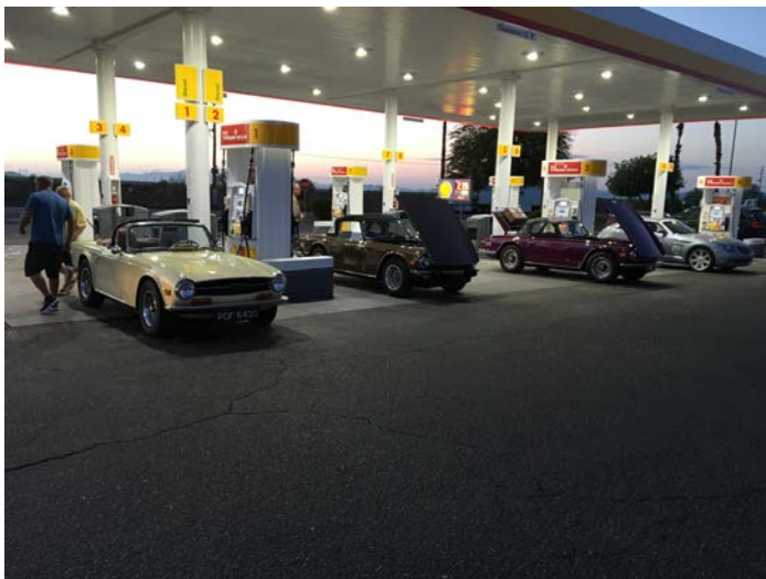
Early morning gas stop

Editor's Note: Here are some more Triumphest photos submitted by Clebe Best.