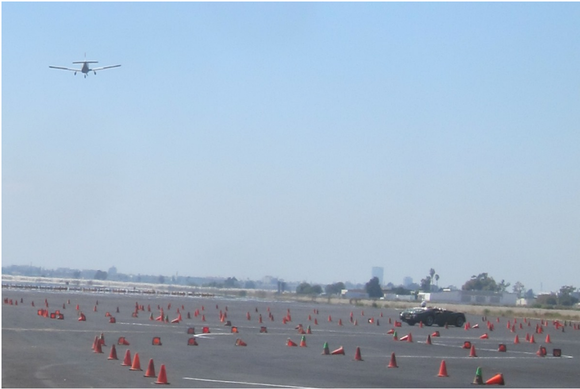
Stu with the Airplane, the autocross was held at a working airport.