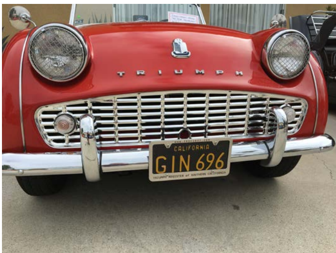
A TR3 on display