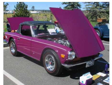
Clebe Best's Deep Purple will put your eye out.