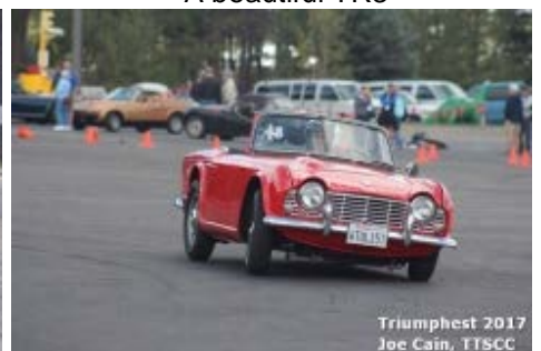
A TR4 in a hard right turn, all wheels down on the ground.