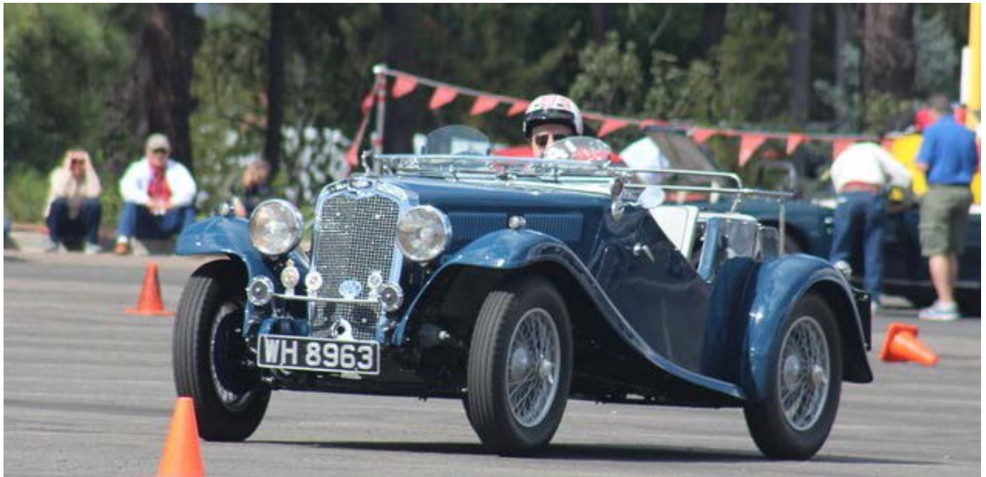
Duncan Wood's 1936 Gloria Southern Cross

October 2017 Vol 38, Issue 10 http://www.dctra.org