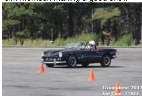
This Spitfire had a GT6- 6cyl engine