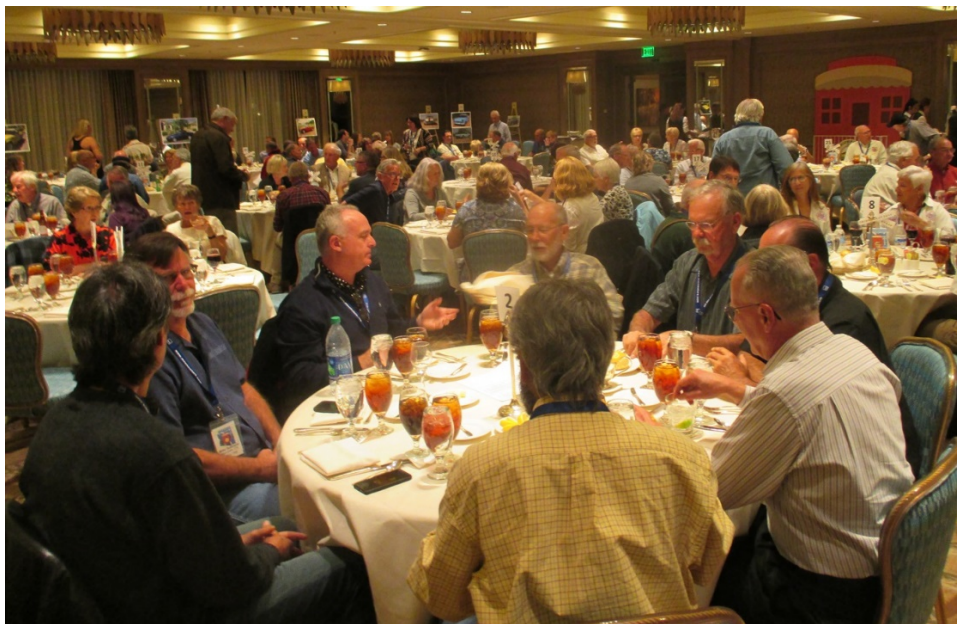
It was a very pleasant dinner, beautiful surroundings and excellent service.