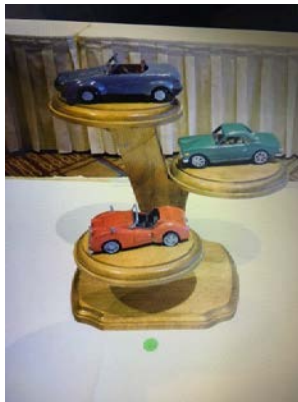
Scratch Built-Don Williams