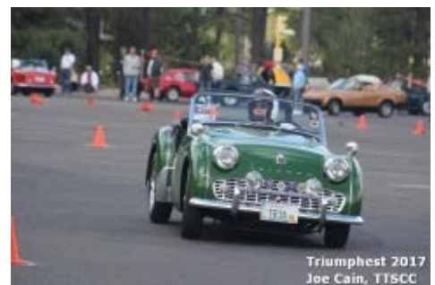
A beautiful TR3