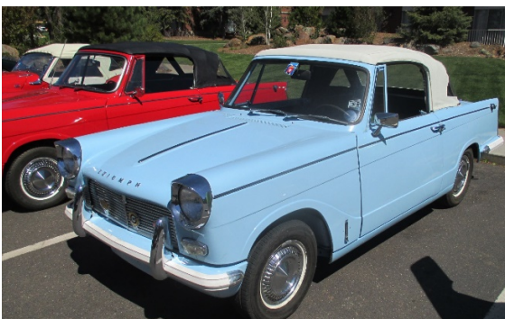
Kathie Nuss's Hattie was looking good.