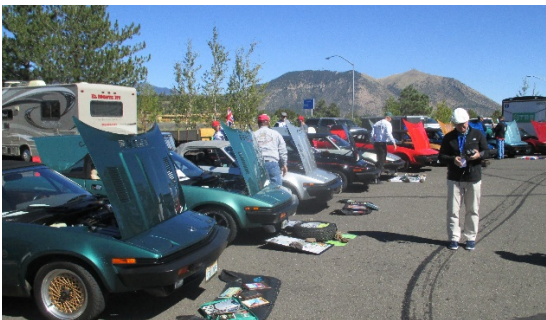
Funcours judging is underway.