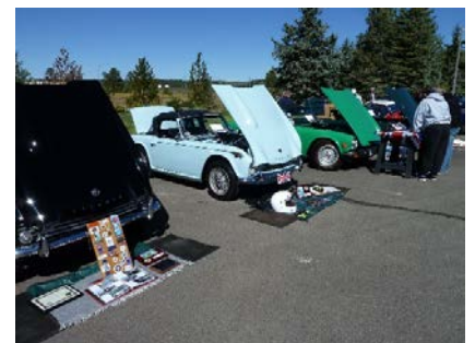
Triumphs on display