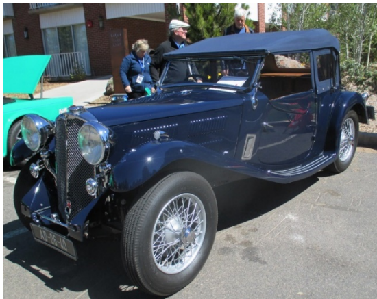
1935 Gloria Monte Carlo, Presidents Choice