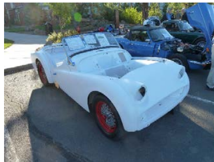
Bob Holt's Little Girl was not yet completed but still made an appearance