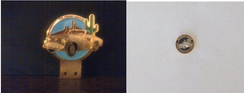
Grille badge (3 inch diameter) Lapel pin (3/4 inch diameter)

We also have Grill badges ($25.00 each), Lapel pins ($5.00 each) and License plate frames (15.00 each) available for purchase.