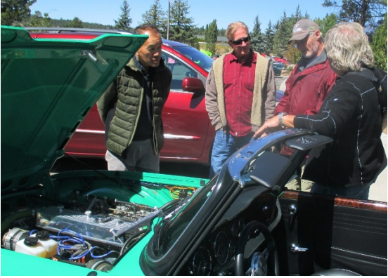
Always discussions about cars and engines