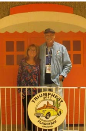
Just a good-looking couple