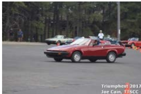
Jim Morrison making a good show