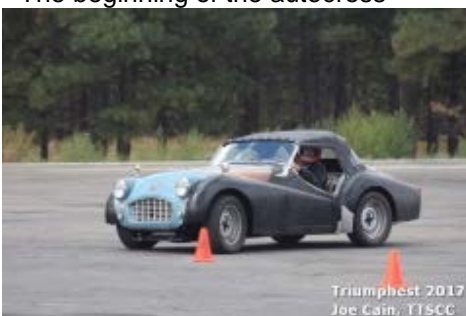
Some contestants were beautiful, others... well, just ran very good.