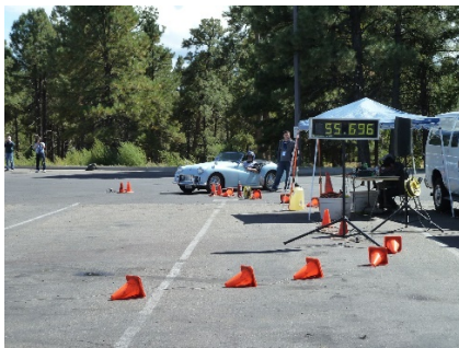
The beginning of the autocross