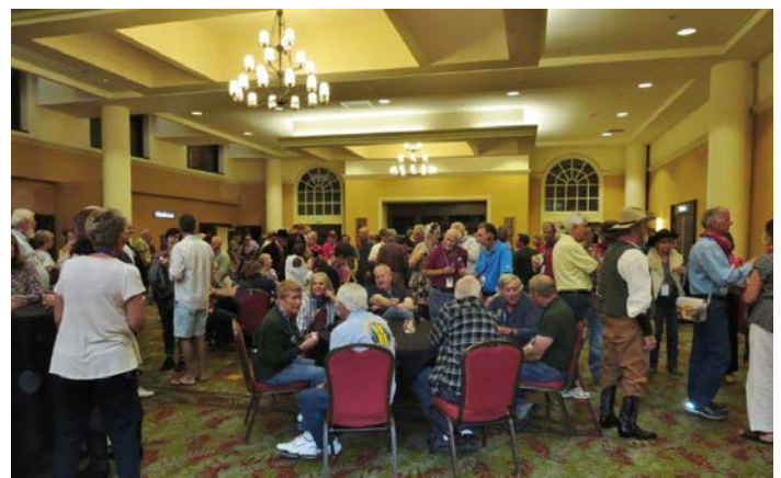
Attendees renewing friendships