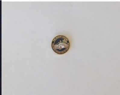
Lapel pin (3/4 inch diameter)

Membership fee _____ Name tags @ $6.00 each _____ Grille badges @ $25.00 each _____ Lapel pins @ $5.00 each _____ Total enclosed _____