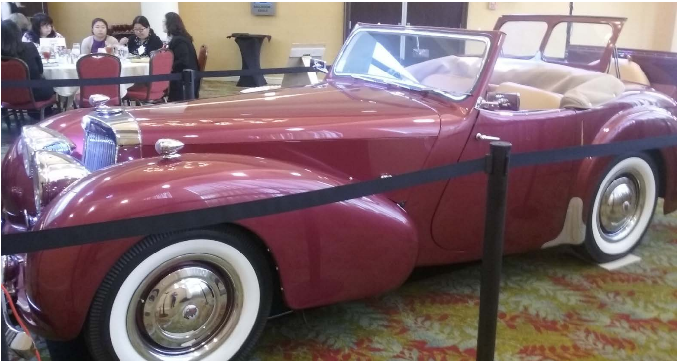
A rare 1949 Triumph 2000

October 2018 Vol 39, Issue 10 http://www.dctra.org