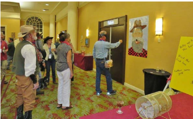
Plant the gold tooth on the miner

Friday night's Hospitality Party was quite unique. I don't remember an event at Triumphest like that before. It was a costumed party based on the '49'er Gold Day Rush Days. There were themed games to play and a BBQ dinner that was delicious. And there was a live band.