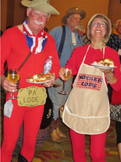
People in costume