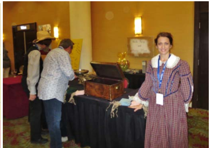
Assayer's office for turning winnings for gold