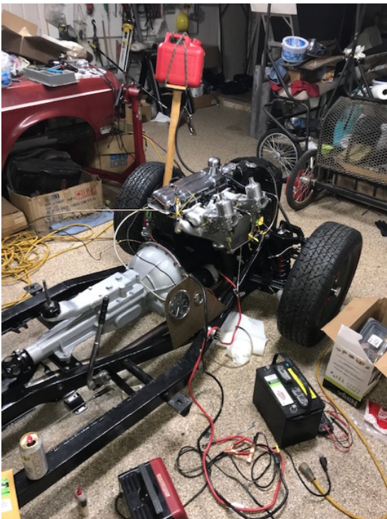
Engine installed with temporary tank and gauges