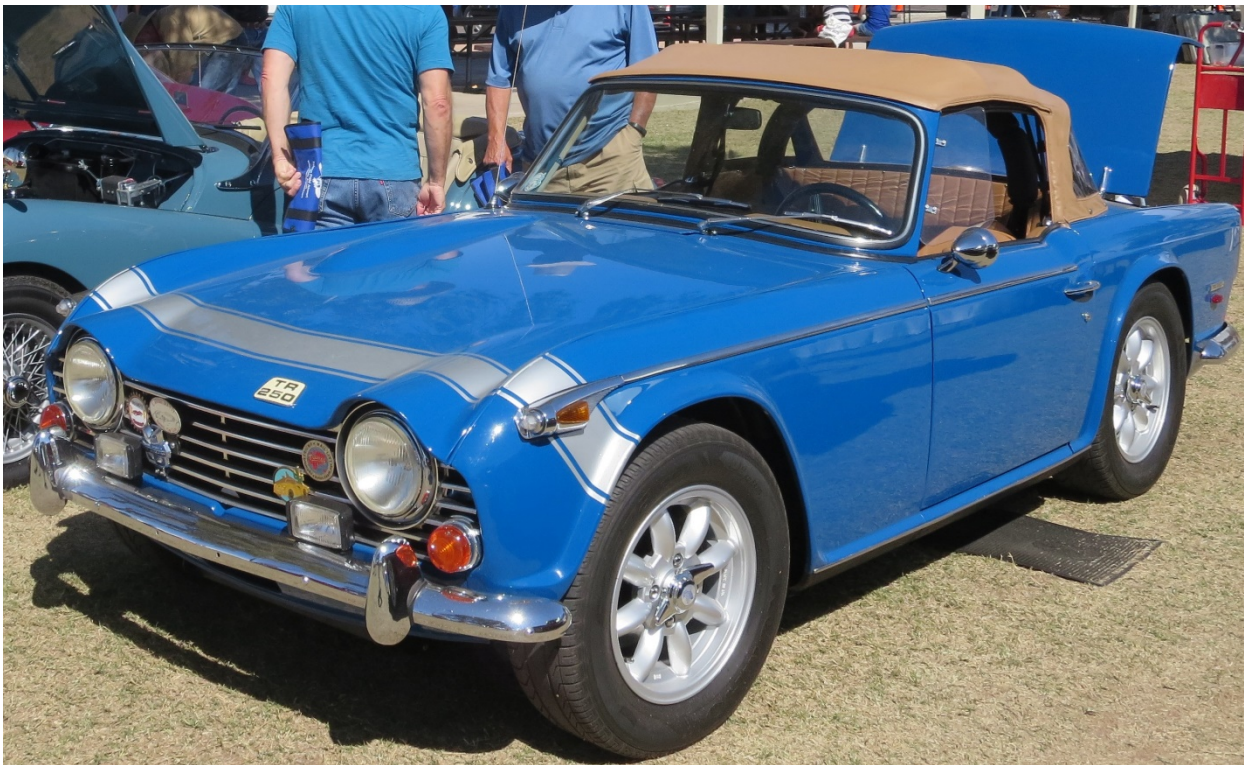
Jim Bauder's TR250