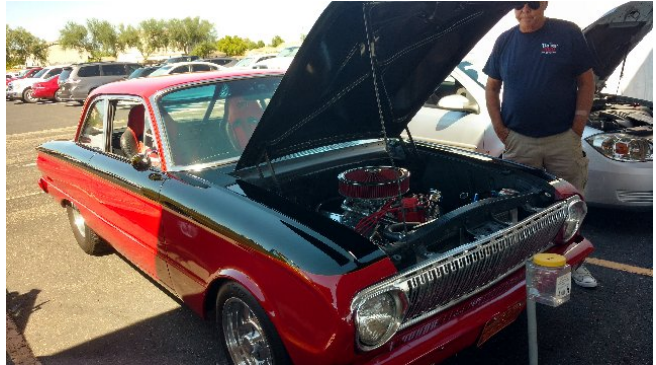
Early Ford Falcon