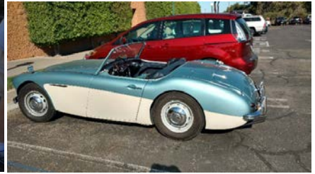
In the parking lot TR-Healey