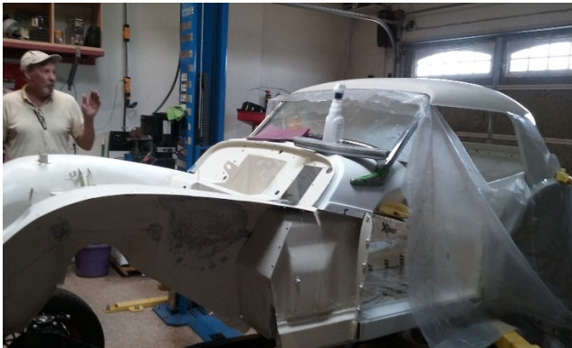
The body ready for paint and installation