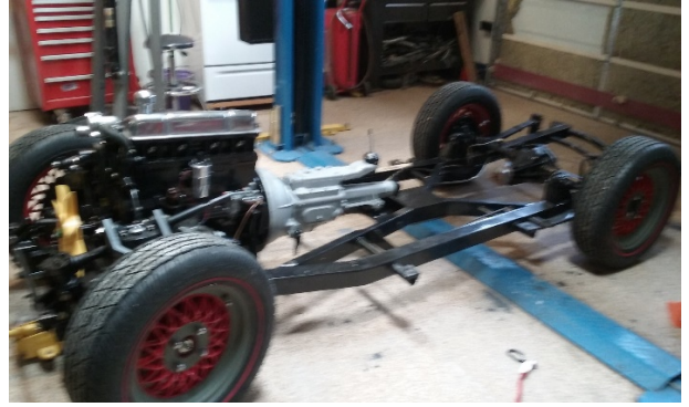
The chassis with the engine installed