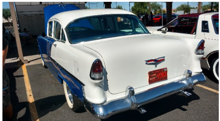
'55 Chevrolet – rear