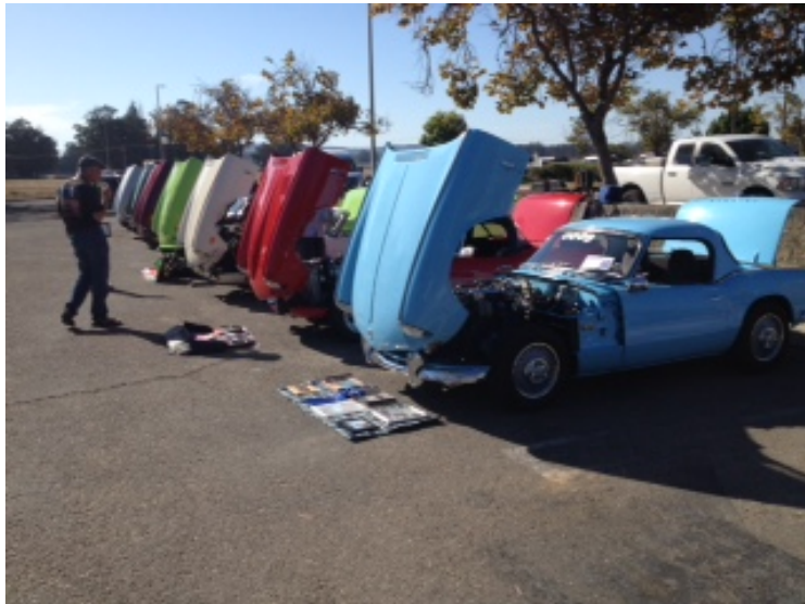
The lineup of Spitfires