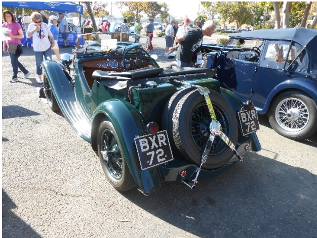
A Southern Cross – Gloria