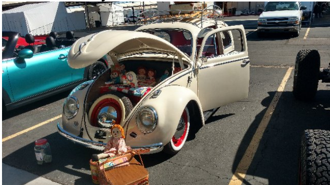
Early VW Beetle