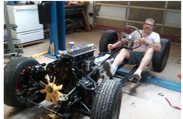
"I don't need no stink'n car body!"