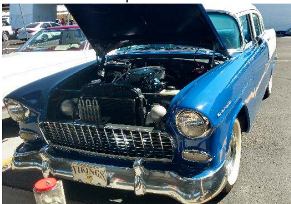
'55 Chevrolet -front