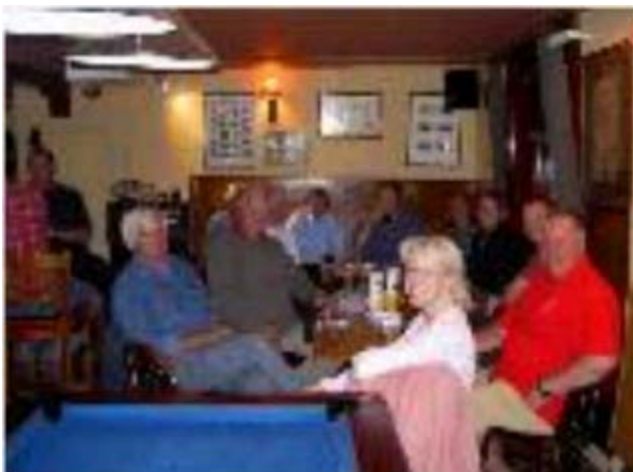
IOW TR Club