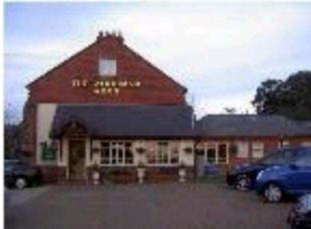
WoodmanArms, meeting place of IOW TR Club