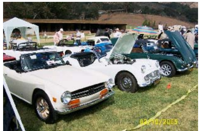
Here are some more SCBCD photos from Stu Lasswell