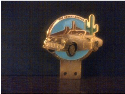
Grille badge (3 inch diameter)

We have grill badges for $25.00 each and lapel pins for $5.00 each available for purchase.