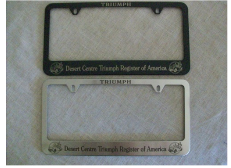
License plate frame

Membership fee _____ Additional Name tags @ $6.00 each _____ Lapel pin @ $5.00 each _____ Grille badges @ $25.00 each _____ License plate frame @ $15.00 each _____ Total enclosed _____