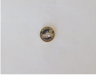
Lapel pin (3/4 inch dia)